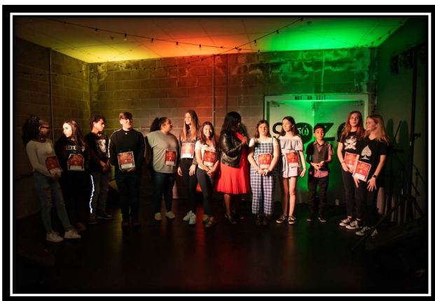
Home Edition Showtime: Video Link

The LIME Foundation hosted two talent shows for youth ages 12-18. The first talent show was held in February at the SoZo Student Center, where we had a number of participants and a large family turnout. Due to COVID 19, we converted the show into a virtual event and hosted another iteration in December. Young people from across Sonoma County performed spoken word, poetry, dance, time-lapse illustrations, satirical comedy, and instrumental music for in-person and online audiences. All participants received prizes but the top winners received up to $500 in cash for their winning acts.