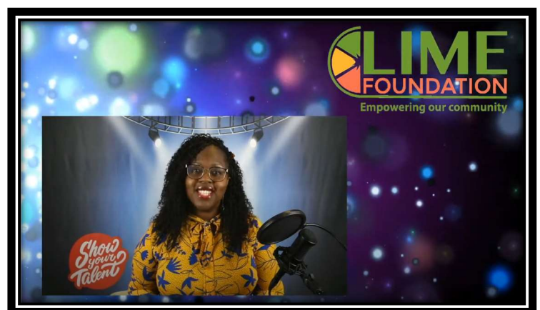
Holiday Showtime: Video Link